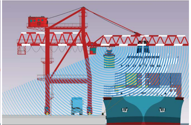
Figure 2. 16-channel 3D LiDAR sensor scans a wide spatial area with single sensing technology with the off-the-shelf controller system.