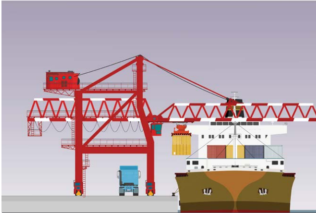
Figure 1. Manual operations become more difficult as equipment becomes taller and wider.