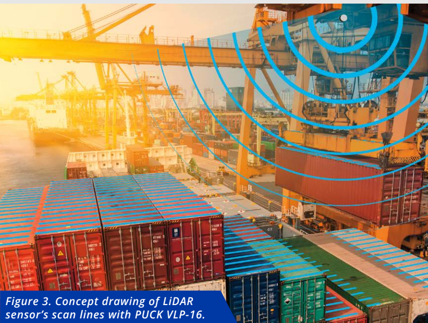
Figure 3. Concept drawing of LiDAR sensor's scan lines with PUCK VLP-16.